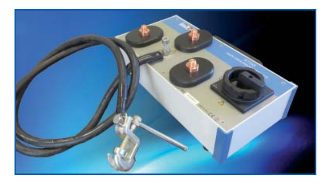
Ground grid test accessories kit