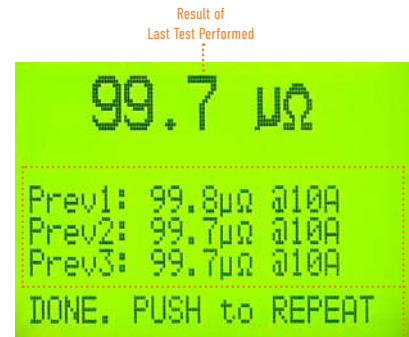
Results from three previous tests

The Auto-Ohm 10 also offers a "Bi-directional" test mode. In this mode, the test current is applied in both directions to the device under test and the readings are recorded. The final test result is the average reading of the bi-directional resistance values. An "Auto" test mode is also available that will start a test once a user applies the test leads to the device under test. The last three readings are displayed on the LCD screen.