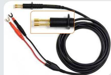
Optional 10A Rated Hand Probe [10/3.0m] (P/N 8000-0225)