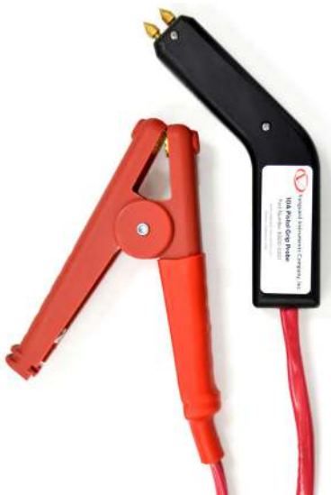
8000-0231 [15'4.6m] (included)

The Auto-Ohm 10 is furnished with a 15 ft (4.57m) cable set with alligator clamps. The test current and voltage sense cables are isolated on the alligator clamps. With this feature, only a single connection is needed to the device under test. Optional Kelvin probe type cables and C-Clamp cables are also available.