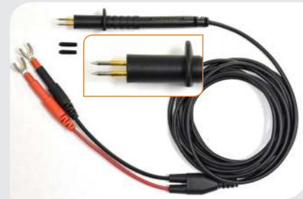
Optional 5A Rated Hand Probe [10/3.0m] (P/N 8000-0226)