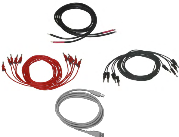
T 1000 PLUS - Standard cable kit

The kit includes cables for any kind of connection.