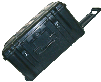
Heavy duty transport case

Heavy duty transport case in black plastics, with wheels, cover and handle.