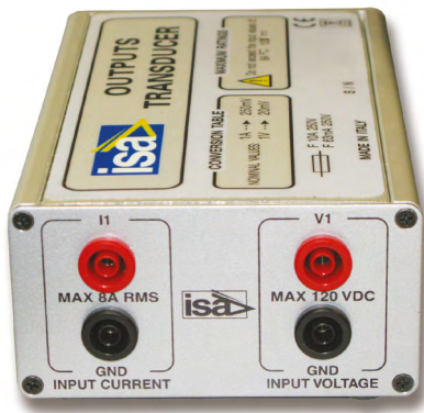
Output transducer module

The items can be ordered separately: the Output transducer alone, or also one cable or both.