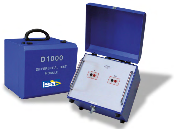
D 1000 Differential relay test module